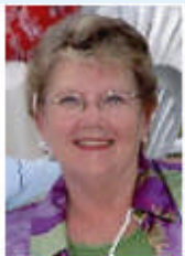
About The Author

America is, or was, a place of tolerance. It accepted various ideas and did not twist words to meet personal agendas. I do not like this "new America" very much. I am tired of being told what I can, or cannot do by ill-informed people. Force-feeding untruths down the throats of pet owners and dog breeders, farmers, hunters, service animals, and those in the entertainment world is simply wrong! Yet, the AR activists run rampant while we live in fear of radical repercussions. Animal activists are not nice people and they do not play fair. Furthermore, they do not intend to quit!